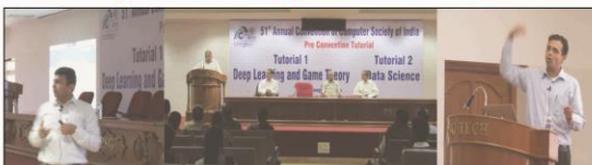
Guest Lecture on "Big Data: Hype and Reality"

PSG College of Technology, Coimbatore 22nd Jan 2017